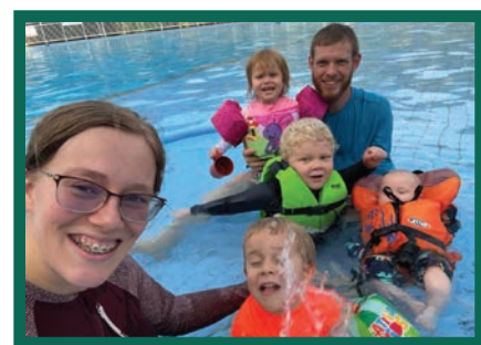
The family tries swimming again—this time, in a safe environment.

When we look back at the week of the accident, we see God’s hand in every detail. The more we remember, the more we see how powerfully He worked on our behalf (Psalm 66:12). ■